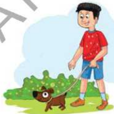
walk the dog