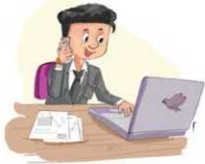
work in the office