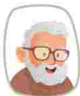
Grandpa Jo Grandfather

D. Write the correct answer based on the family tree.